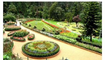
Government Botanic Garden